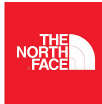
Ice Climbing The North Face Korea