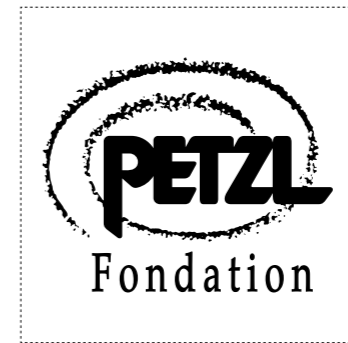
Training Standards Petzl Foundation