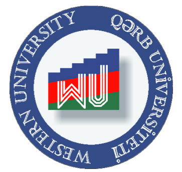
Mountain Protection Western University