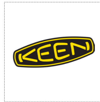
Mountain Protection Keen