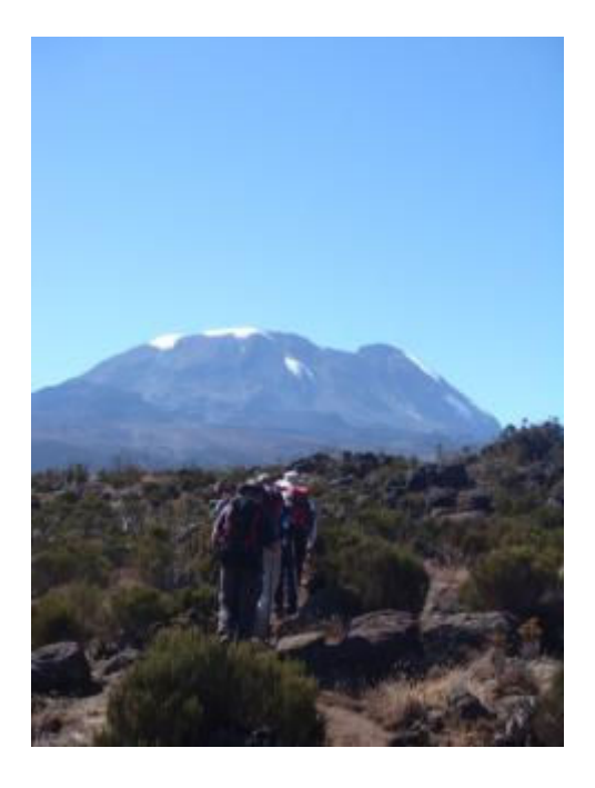
Safety and Success on Kilimanjaro