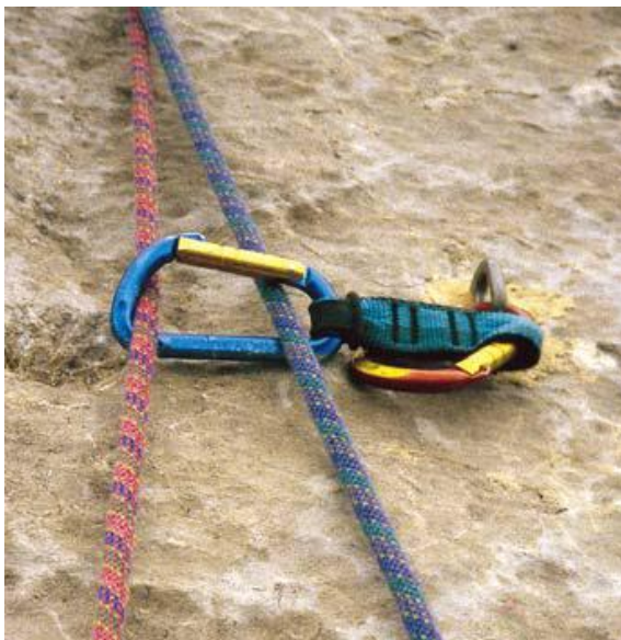
Figure 1.5 Badly-positioned karabiner

When clipping bolts or pegs with quickdraws, make sure that the rope is running in the correct direction through the karabiner ie. that the karabiner gate faces away from the direction of travel. Also, on slab routes it is possible for the quickdraw to move such that the karabiner gate will be loaded and open in a fall (see Figure 1.5). For a similar reason, do not clip two karabiners together directly; in a fall the body of one can lever open the gate of the other, and disconnect them.