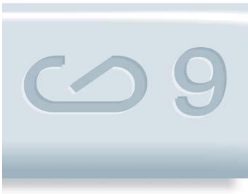
Figure 1.2 Gate-open markings