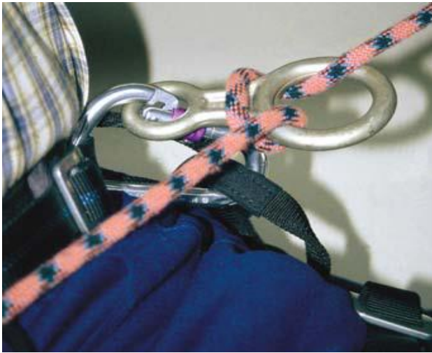
Figure 1.3 A figure-of-8 forcing open a screwgate karabiner.

Even with a screwgate karabiner, the gate may be forced open in certain situations, particularly when using a figure-of-8. In this case it is possible for the figure-of-8 to lever open the gate if the system is loaded under an 'abnormal configuration' as shown in Figure 1.3. When abseiling or belaying with a figure-of-8, you must be vigilant at all times to ensure that the figure-of-8 does not come into contact with the gate.