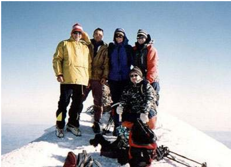
Photo of some participants on the top of Mt. Elbrus.