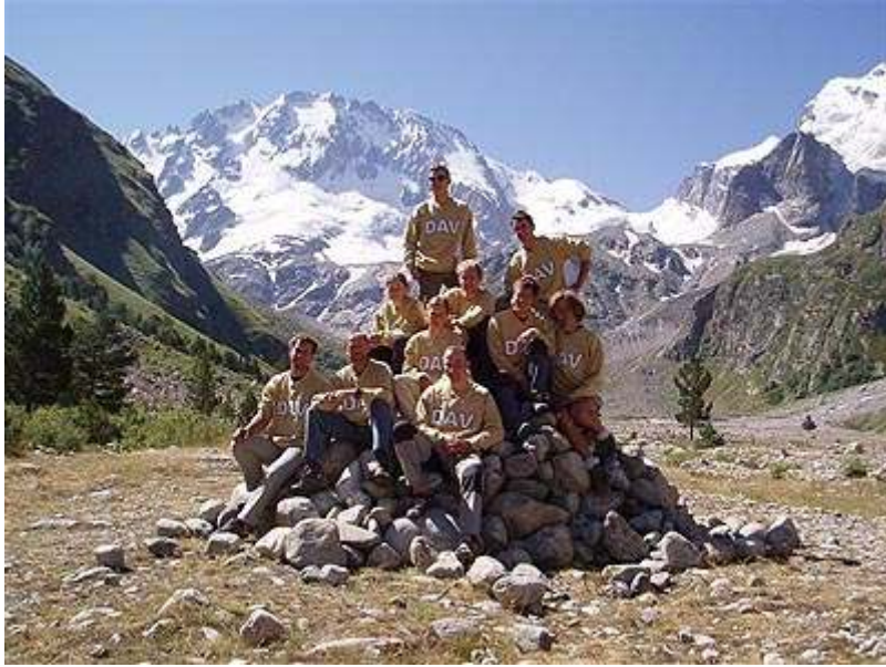
Photo of the group from DAV (Germany) on the background of the peak Ullu-Tau.

07.08.2004 All the participants descended to Adyr-Su Valley.