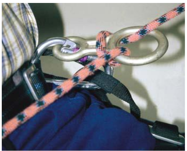
Figure 1.3 A figure-of-8 forcing open a screwgate karabiner.

Even with a screwgate karabiner, the gate may be forced open in certain situations, particularly when using a figure-of-8. In this case it is possible for the figure-of-8 to lever open the gate if the system is loaded under an 'abnormal configuration' as shown in Figure 1.3. When abseiling or belaying with a figure-of-8, you must be vigilant at all times to ensure that the figure-of-8 does not come into contact with the gate.