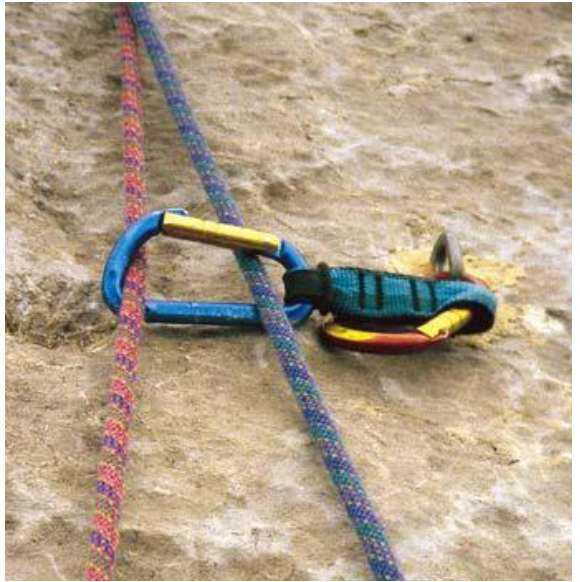
Figure 1.5 Badly-positioned karabiner

When clipping bolts or pegs with quickdraws, make sure that the rope is running in the correct direction through the karabiner ie. that the karabiner gate faces away from the direction of travel. Also, on slab routes it is possible for the quickdraw to move such that the karabiner gate will be loaded and open in a fall (see Figure 1.5). For a similar reason, do not clip two karabiners together directly; in a fall the body of one can lever open the gate of the other, and disconnect them.